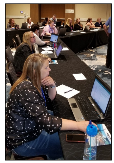
INTERMEDIATE EXCEL LAB